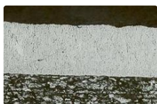
AeroNikl @ 250 Soft Sulfamate Nickel

Anti-galling • Surface Hardness • Wear Resistance • Corrosion Resistance • Refurbishments